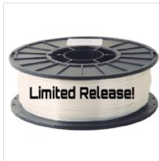
Pearl PLA Filament Reels

( http://toner-plastics.com/product/tpu-filament-reels/ )