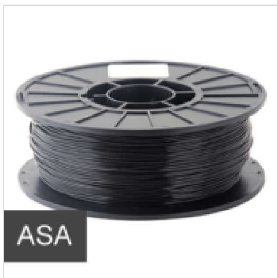
ASA Filament Reels

( http://toner-plastics.com/product/asa-filament-reels/ )