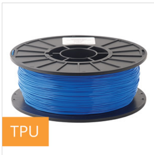
TPU Filament Reels

( http://toner-plastics.com/product/asa-filament-reels/ )