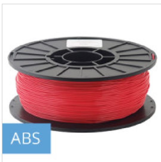
ABS Filament Reels

( http://toner-plastics.com/product/pearl-pla-filament-reels/ )