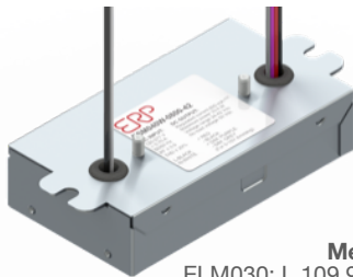
Metal Case ELM030: L 109.9 x W 59.8 x H 25.4 mm (L 4.33 x W 2.35 x H 1.0 in) ELM040/050: L 127 x W 70 x H 28 mm (L 5 x W 2.76 x H 1.1 in)