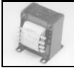
Style NV with lugs