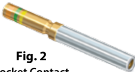
Fig. 2 Socket Contact