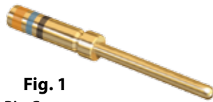
Fig. 1 Pin Contact