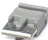
Single plug-in bridge, color: gray

Single plug-in bridge - FBST 6-PLC GY - 2966825