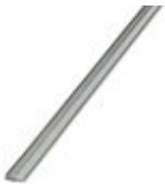
Continuous plug-in bridge, color: gray

Continuous plug-in bridge - FBST 500-PLC GY - 2966838