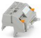
V8 adapter for 8 x PLC-INTERFACE (6.2 mm), controller: PLC system cabling of output cards, connection 1: Screw connection 1x, connection 2: IDC/FLK pin strip 1x 14-position, connection 3: Plug-in connection (Can be snapped onto 8x PLC-INTERFACE terminals), number of channels: 8, control logic: plusschaltend

System connection - PLC-V8/FLK14/OUT - 2295554