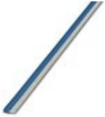
Continuous plug-in bridge, color: blue

Continuous plug-in bridge - FBST 500-PLC BU - 2966692