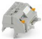
V8 adapter for 8 x PLC-INTERFACE (6.2 mm), controller: PLC system cabling of output cards, connection 1: Screw connection 1x, connection 2: IDC/FLK pin strip 1x 14-position, connection 3: Plug-in connection (Can be snapped onto 8x PLC-INTERFACE terminals), number of channels: 8, control logic: minusschaltend

System connection - PLC-V8/FLK14/OUT/M - 2304102