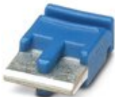
Single plug-in bridge, color: blue

Single plug-in bridge - FBST 6-PLC BU - 2966812