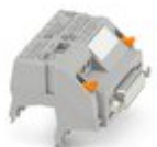
V8 adapter for 8 x PLC-INTERFACE (6.2 mm), controller: PLC system cabling of output cards, connection 1: Screw connection 1x, connection 2: D-SUB socket strip 1x 15-position, connection 3: Plug-in connection (Can be snapped onto 8x PLC-INTERFACE terminals), number of channels: 8, control logic: plusschaltend

System connection - PLC-V8/D15B/OUT - 2296061