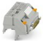
V8 adapter for 8 x PLC-INTERFACE (6.2 mm), controller: PLC system cabling of output cards, connection 1: Screw connection 1x, connection 2: D-SUB pin strip 1x 15-position, connection 3: Plug-in connection (Can be snapped onto 8x PLC-INTERFACE terminals), number of channels: 8, control logic: plusschaltend

Adapter module - PLC-V8/D15S/OUT - 2296058