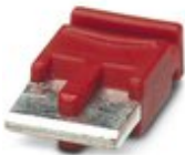
Single plug-in bridge, color: red

Single plug-in bridge - FBST 6-PLC RD - 2966236