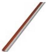
Continuous plug-in bridge, color: red

Continuous plug-in bridge - FBST 500-PLC RD - 2966786