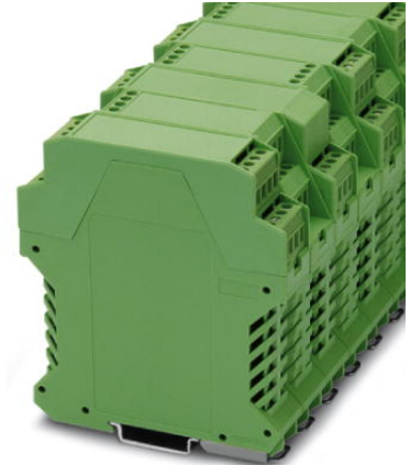
Illustration shows fully mounted versions of the electronic housing, in green

http://eshop.phoenixcontact.de/phoenix/treeViewClick.do?UID=2909840