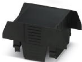
Component housing, connection opening on both sides, Upper part, color: black, width: 45 mm

Please be informed that the data shown in this PDF Document is generated from our Online Catalog. Please find the complete data in the user's documentation. Our General Terms of Use for Downloads are valid ( http://phoenixcontact.com/download )