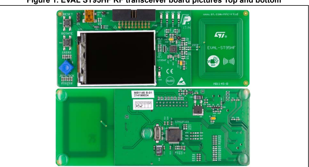
Figure 1. EVAL ST95HF RF transceiver board pictures Top and bottom