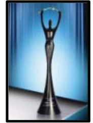
Electra Award 2005