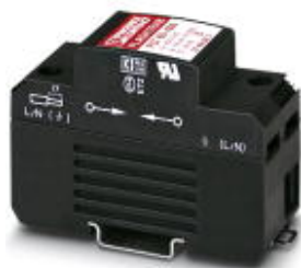
Type 1 / Class I / B arrester (lightning current arrester) with arc chopping spark gap, 1-channel. Housing width: 35 mm (2 div.)

Please be informed that the data shown in this PDF Document is generated from our Online Catalog. Please find the complete data in the user's documentation. Our General Terms of Use for Downloads are valid ( http://phoenixcontact.com/download )