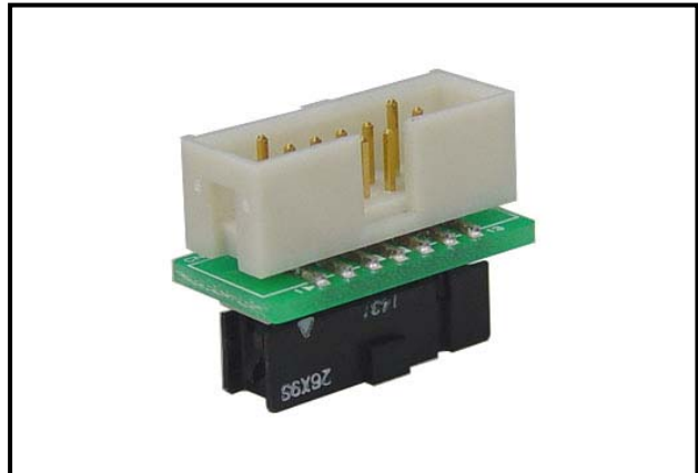
Figure 1 External View of the R0E000010ACB00

The availability of the hot plug-in function depends on the MCU and emulator debugger used. For the information of this function, be sure to read the latest edition of "E1/E20 Emulator Additional Document for User's Manual" supplied for each MCU group.