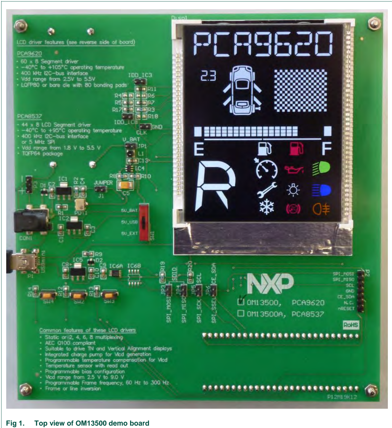
Fig 1. Top view of OM13500 demo board

For best optical performance, remove the protective foil from the display.