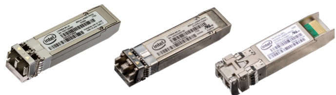
Intel® Ethernet SFP28 Optics (SR, and SR and LR extended temp)