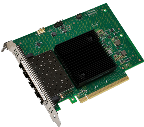
E810-XXVDA4 (Also available in low profile)

Intel® Ethernet Optics, and specification-compliant Active Optical Cables and Direct Attach Cables, can support multiple configurations.