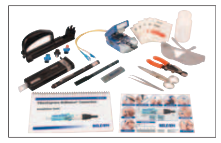
Available Accessories include: Support Handle, VFL, Precision Cleaver, Field Cleaver, Installation Guide, Card, Video, and fiber preparation tools.

BICSI accredited training provides RCDDs, Installers and Techs as well as organizations with certified staff recognition of their skills and competence to help differentiate themselves from the competition. The BICSI accredited IBDN-749 course covers the basics of fiber safety to advanced topics including test methodologies and troubleshooting with industry leading automated Optical Loss Test Sets (OLTS). A key component of this training is the hands on Fiber Express Brilliance connector termination where students master the art and feel of fiber termination from expert instructors.