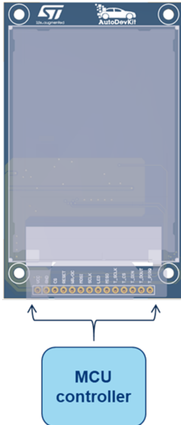
Figure 1. AEK-LCD-DT028V1 block diagram