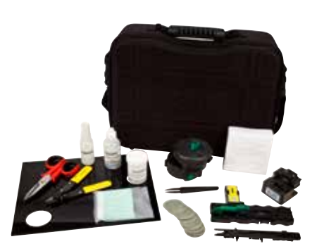
3M<sup>™</sup> Crimplok<sup>™</sup>+ SC/APC Connector Kit 8765-APC for 3M<sup>™</sup> Crimplok<sup>™</sup>+ Connectors 8700-APC