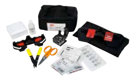
3M<sup>™</sup> Fibrlok<sup>™</sup> Splice Kit with Cleaver 2559-C

3M<sup>™</sup> Fiber Optic Angle Cleaver Kit 2565 includes 3M<sup>™</sup> Fiber Optic Angle Cleaver 2535, 3M<sup>™</sup> Fibrlok<sup>™</sup> Angle Splice Assembly Tool 2501-AS and all tools necessary for 3M<sup>™</sup> Fibrlok<sup>™</sup> Angle Splices.