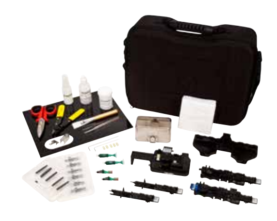
3M<sup>™</sup> Fiber Optic Angle Cleave Kit 2565

The 3M<sup>™</sup> Fiber Optic Angle Cleave Kit 2565 provides the tools necessary to terminate 3M<sup>™</sup> No Polish LC/APC and SC/APC Angle Splice Connectors. The 3M<sup>™</sup> Fibrlok<sup>™</sup> Angle Splice Assembly Tool 2501-AS is also included to terminate 3M<sup>™</sup> Fibrlok<sup>™</sup> Angle Splices. Replacement parts are available.