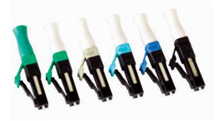
3M^{^{\rm \tiny M}} \text{ No Polish LC Connector Family}