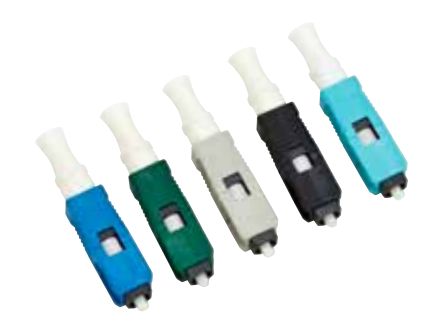
3M<sup>™</sup> Crimplok<sup>™</sup>+ 250µm/900µm Connector Family

Crimplok+ connectors have a thermally balanced design that is tested for premises and FTTP applications for indoor and outdoor conditions.