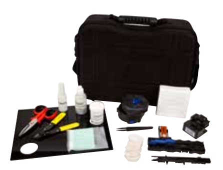
3M<sup>™</sup> Crimplok<sup>™</sup>+ SC/UPC Connector Kit 8765-UPC for 3M<sup>™</sup> Cripmlok<sup>™</sup>+ Connectors 8700-UPC and 6700 Series

3M<sup>™</sup> Crimplok<sup>™</sup>+ Connector Kits 8765-UPC/8765-APC provide the tools needed to terminate 3M Crimplok+ Connectors 8700-UPC 6700 and 8700-APC series, respectively. Both kits contain the same fiber preparation tools including a high quality cleaver, a work surface and a case with an integrated hook for easy hanging. Each kit contains a specific 3M<sup>™</sup> Crimplok<sup>™</sup>+ Protrusion Setting Tool and 3M<sup>™</sup> Crimplok<sup>™</sup>+ Nano Finishing Tool, depending upon the connector type. UPC tools provide a square finish while APC tools provide a 8° angled finish.