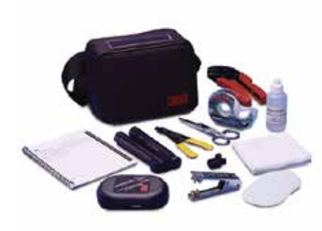
3M<sup>™</sup> Crimplok<sup>™</sup> Kit 6955 (components displayed)