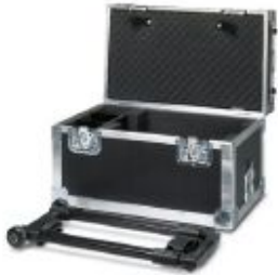
Transport case for THERMOMARK ROLL X1 thermal transfer printer, rounded profile case with aluminum frame

Please be informed that the data shown in this PDF Document is generated from our Online Catalog. Please find the complete data in the user's documentation. Our General Terms of Use for Downloads are valid ( http://phoenixcontact.com/download )