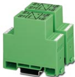
Power supply unit, for passive S0 meter interfaces, input: 230 V AC, output: S0

Please be informed that the data shown in this PDF Document is generated from our Online Catalog. Please find the complete data in the user's documentation. Our General Terms of Use for Downloads are valid ( http://phoenixcontact.com/download )