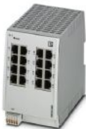
Managed Switch 2000, 16 RJ45 ports 10/100 Mbps, degree of protection: IP20, PROFINET Conformance-Class A

Please be informed that the data shown in this PDF Document is generated from our Online Catalog. Please find the complete data in the user's documentation. Our General Terms of Use for Downloads are valid ( http://phoenixcontact.com/download )