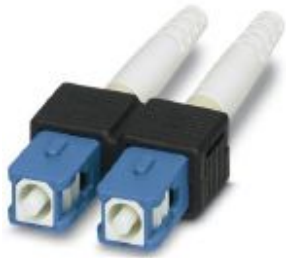
SC duplex connector, with long bend protection, for single mode 9/125 µm, PC polishing, blue, value pack: 10 pcs

Please be informed that the data shown in this PDF Document is generated from our Online Catalog. Please find the complete data in the user's documentation. Our General Terms of Use for Downloads are valid ( http://phoenixcontact.com/download )