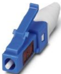
LC connector, with short bend protection (pigtail), for single mode 9/125 µm, PC polishing, blue

Please be informed that the data shown in this PDF Document is generated from our Online Catalog. Please find the complete data in the user's documentation. Our General Terms of Use for Downloads are valid ( http://phoenixcontact.com/download )