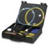
Tool set for GOF assembly

Tool set - FOC-TOOL-GOF KONF SET - 1411049