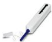
Ferrule cleaner, 1.25 mm, for LC, approx. 500 cleaning cycles