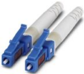
LC duplex connector, with long bend protection, for single mode 9/125 µm, PC polishing, blue

Please be informed that the data shown in this PDF Document is generated from our Online Catalog. Please find the complete data in the user's documentation. Our General Terms of Use for Downloads are valid ( http://phoenixcontact.com/download )