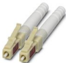
LC duplex connector, with long bend protection, for multi-mode 50/125 µm, beige

Please be informed that the data shown in this PDF Document is generated from our Online Catalog. Please find the complete data in the user's documentation. Our General Terms of Use for Downloads are valid ( http://phoenixcontact.com/download )