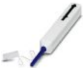
Ferrule cleaner, 1.25 mm, for LC, approx. 500 cleaning cycles

FO accessories - FOC-TOOL-FERRULECLEANER-1.25 - 1407032