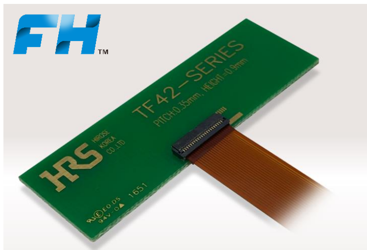
FH Flip-Lock Pioneer Hirose