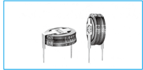
Marking color : White print on an indigo sleeve