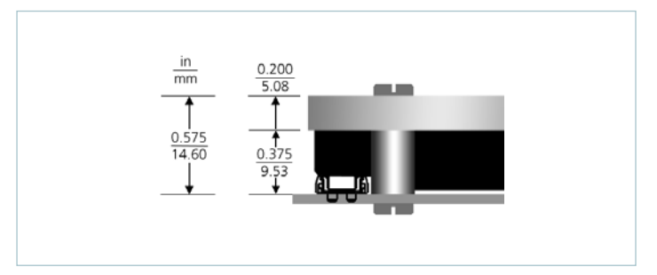
Figure 15.4 — Through-hole or threaded baseplate; height above board with standoff