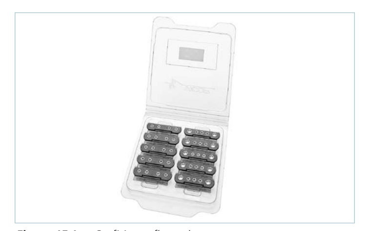
Figure 15.1 — SurfMates; five-pair sets