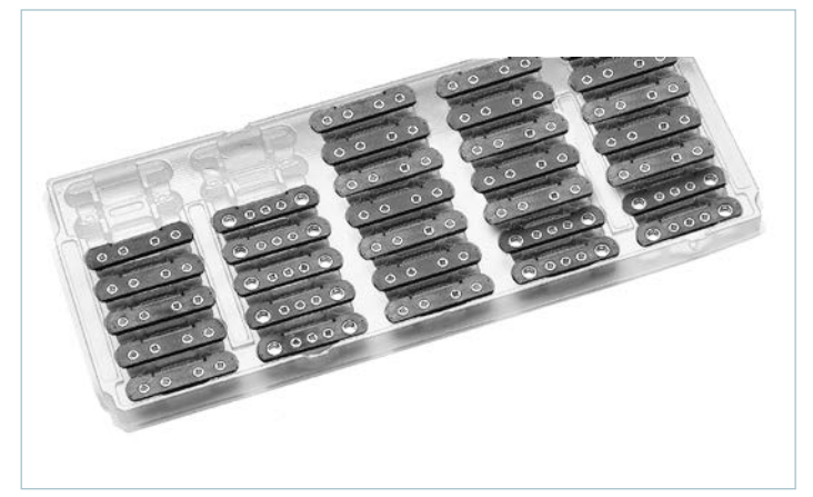
Figure 15.2 — SurfMates; individual part numbers