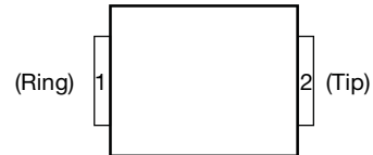
Terminal typical application names shown in parenthesis