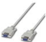
RS-232 cable, 9-pos. D-SUB socket on 9-pos. D-SUB socket, 9-wire, 1:1

Data cable - PSM-KA9SUB9/BB/2METER - 2799474