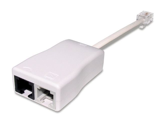
Z-330P2J2 xDSL over POTS CPE In-Line Filter