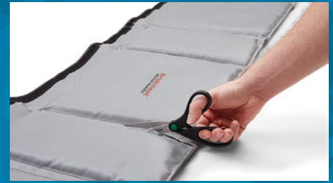
Cut to Length Modular System