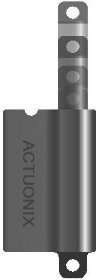
PQ12 Actual Size