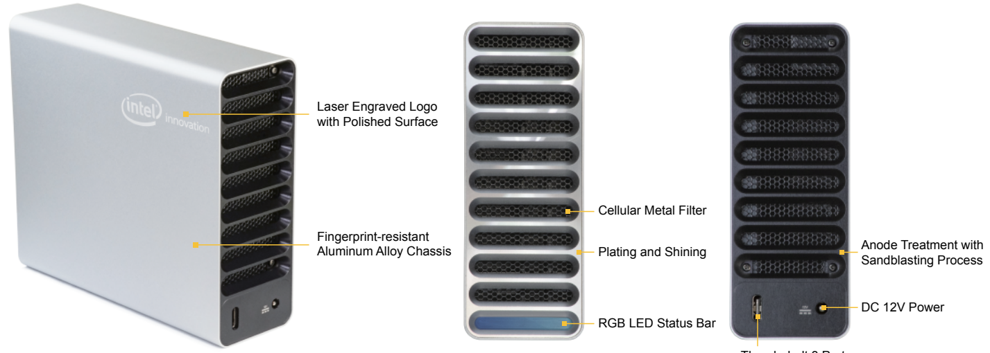
Thunderbolt 3 Port Support 40Gbps Bandwidth