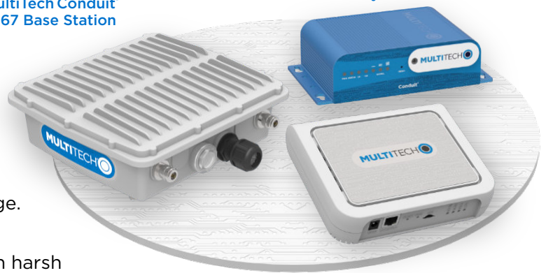
MultiTech Conduit® AP Access Point