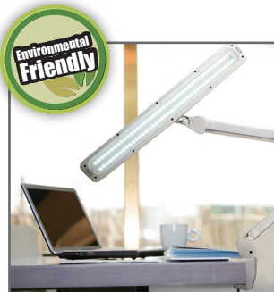
Control panel for power on/off and lighting adjustment

A good working light makes your job more efficient and comfortable.