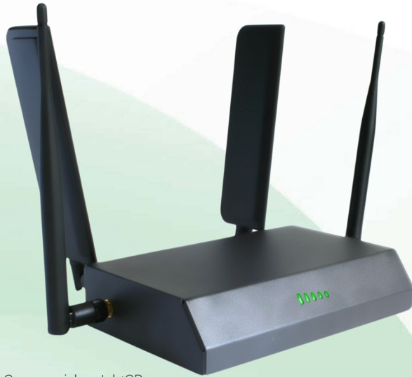
Commercial metal 4GR