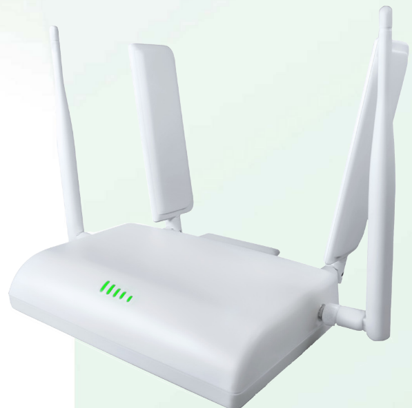
Consumer plastic 4GR