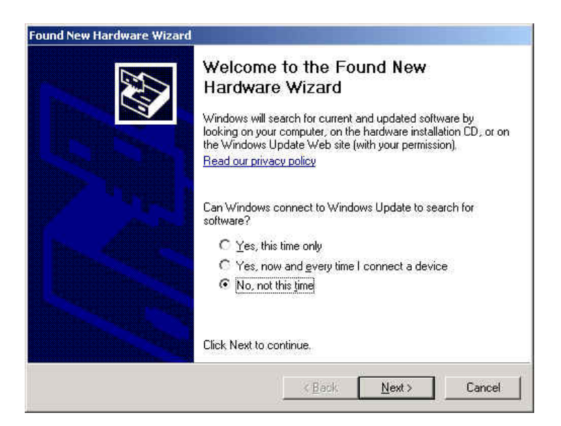
Figure 1: Found New Hardware Wizard

The driver package downloadable from the Support \rightarrow Software download page of <u>www.telegesis.com</u> should be unzipped into a local folder. When executing the file 'TgVCPInstaller.exe' prior to plugging in the ETRX2USB stick an installer will guide you through the steps required for the driver installation. If prompted that the driver has not passed the Windows logo test simply press 'Continue Anyway'.