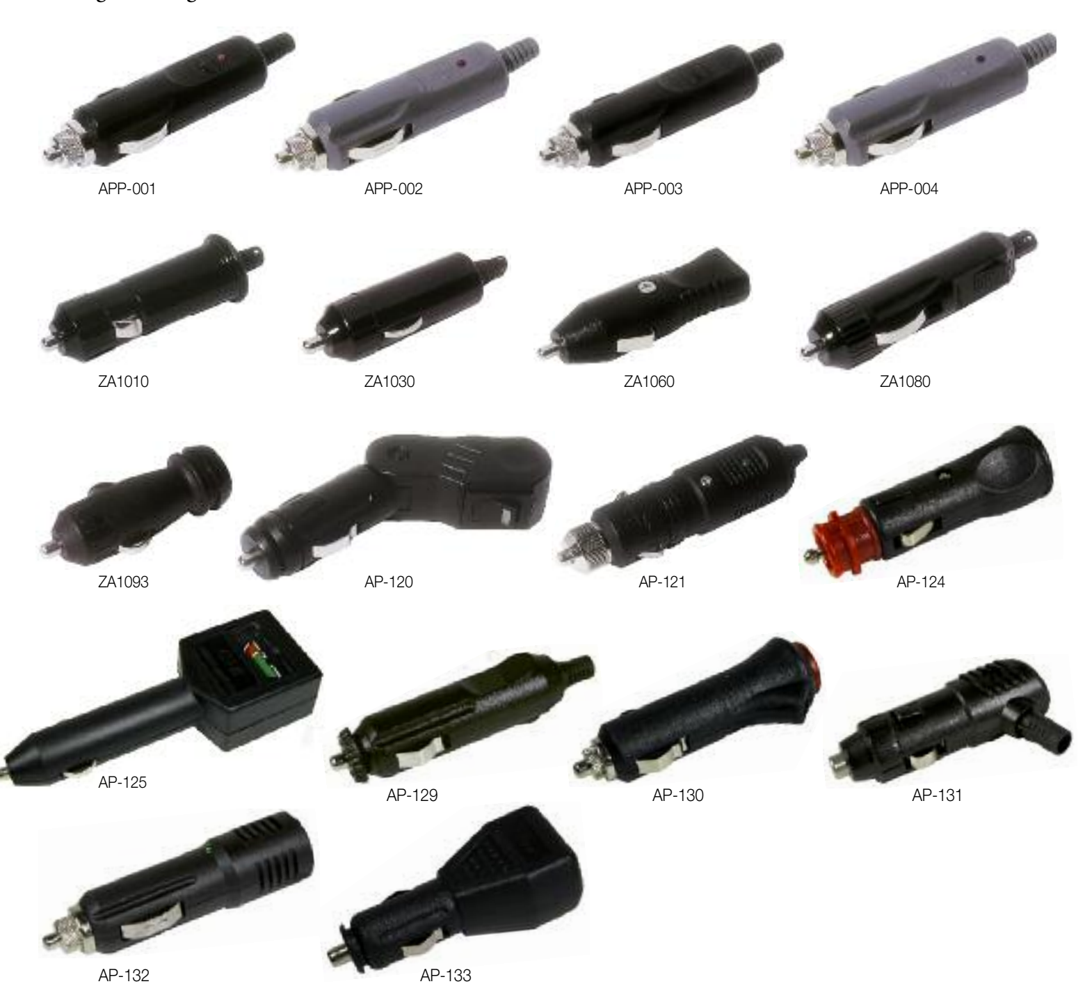
High Amperage Auto Cigarette Plugs