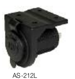
(available with and without markings)