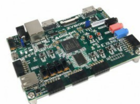
Zybo Z7-20 Zynq-7000 ARM/FPGA SoC Plattform + SDSoC Voucher