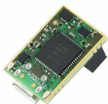
ARROW USB Programmer2 for development with Intel FPGAs - 2.54mm header