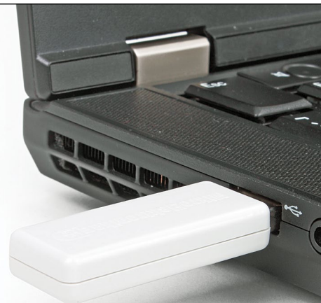
Figure 3: USB Dongle plugged into Laptop USB host connector

Unfortunately not. If you lose your dongle you will need to buy a new compiler license and pay the full price.