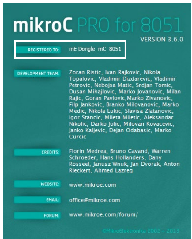
Figure 2: mikroC PRO for 8051 About window