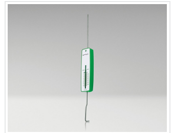
GPP-15 - Gauge, Push-Pull 0-6804 GR/0-15 LBS