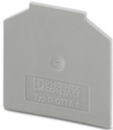
End cover, length: 43.5 mm, width: 1.5 mm, height: 40.8 mm, color: gray

Please be informed that the data shown in this PDF Document is generated from our Online Catalog. Please find the complete data in the user's documentation. Our General Terms of Use for Downloads are valid ( http://phoenixcontact.com/download )