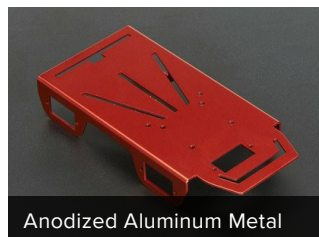
Anodized Aluminum Metal