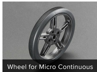
Wheel for Micro Continuous