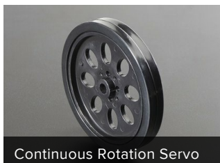
Continuous Rotation Servo