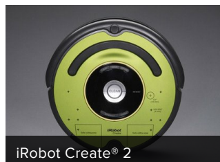
iRobot Create® 2