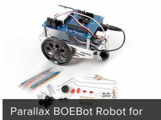
Parallax BOEBot Robot for