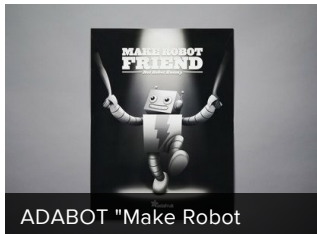
ADABOT "Make Robot