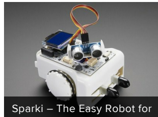
Sparki - The Easy Robot for