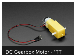
DC Gearbox Motor - "TT