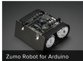
Zumo Robot for Arduino