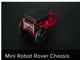
Mini Robot Rover Chassis