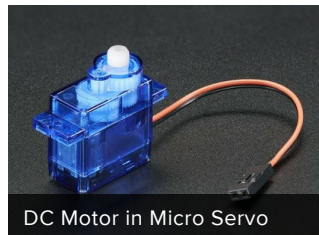
DC Motor in Micro Servo