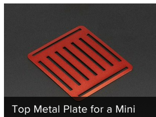
Top Metal Plate for a Mini