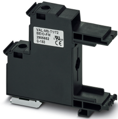
Base element for type 1/2 arresters from the VALVETRAB MS T1/T2 product range. Version: 1-channel

Please be informed that the data shown in this PDF Document is generated from our Online Catalog. Please find the complete data in the user's documentation. Our General Terms of Use for Downloads are valid ( http://phoenixcontact.com/download )