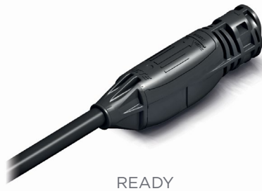
READY (fully closed)

Note: for detailed instructions, check Application Specification 114-133104