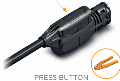
PRESS BUTTON (terminate cable)