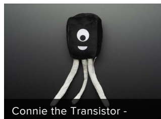
Connie the Transistor -