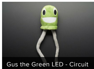
Gus the Green LED - Circuit