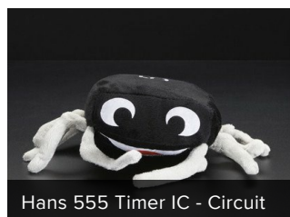
Hans 555 Timer IC - Circuit