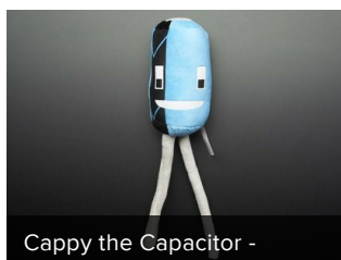
Cappy the Capacitor -