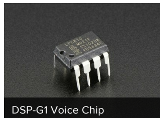
DSP-G1 Voice Chip