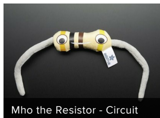
Mho the Resistor - Circuit