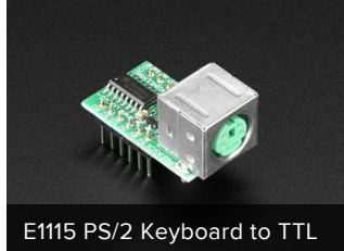
E1115 PS/2 Keyboard to TTL