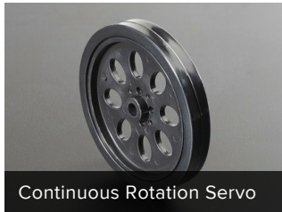
Continuous Rotation Servo