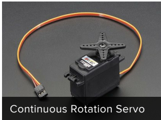
Continuous Rotation Servo