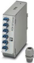
DIN rail splice box, fully mounted ready to splice, for 6x LC duplex (OS2)

Please be informed that the data shown in this PDF Document is generated from our Online Catalog. Please find the complete data in the user's documentation. Our General Terms of Use for Downloads are valid ( http://phoenixcontact.com/download )